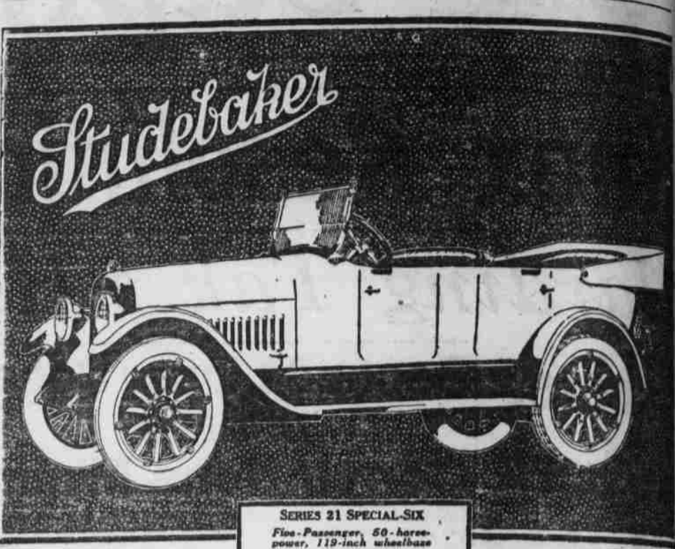
SERIES 21 SPECIAL-SIX Five-Passenger, 60-horsepower, 119-inch wheelbase $1750 f.o.b. Detroit

FROM the raw material to the finished product the Studebaker standards of manufacture, inspection and assembly are the highest known in the industry—and the remarkable performance of Studebaker cars is largely due to the fact that these standards are constantly maintained.