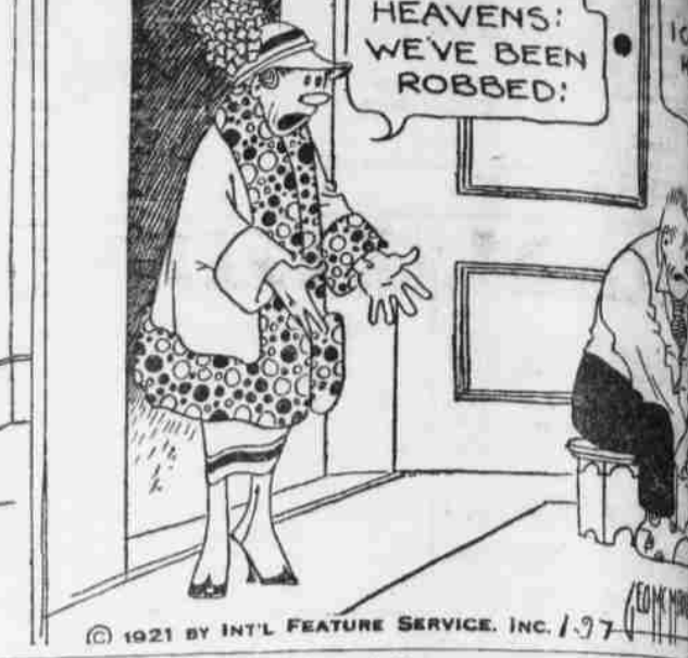
1-27

structed and finished with a hard surface. "2. The Pacific highway from Multnomah county line through Washington county and Yamhill county by way of Hillsboro, Forest Grove, McMinnville, to Dallas, Monmouth and Independence in Polk county; to Corvallis and Monroe in Benton county, and through Eugene to the north line of Douglas county." And Whereas, certain individuals are circulating petitions for the purpose of recalling the present county judge based upon certain objects and principals among which is recited to be "co-operation with the state highway commission in locating the West Side Pacific highway from McMinnville through Holmes Gap, Rickreall to Monmouth, thence south to Corvallis, all of which is contrary to the letter and spirit of the above-mentioned law; and Whereas, It is of the utmost importance to the future welfare and development of this community and to the city of Dallas, and its inhabitants, that the above mentioned law be enforced and the state highway commission be compelled to construct the West Side highway according to the letter and spirit of the law; and Whereas, Certain individual residents and inhabitants of the city of Dallas have publicly announced that they favor the location of said