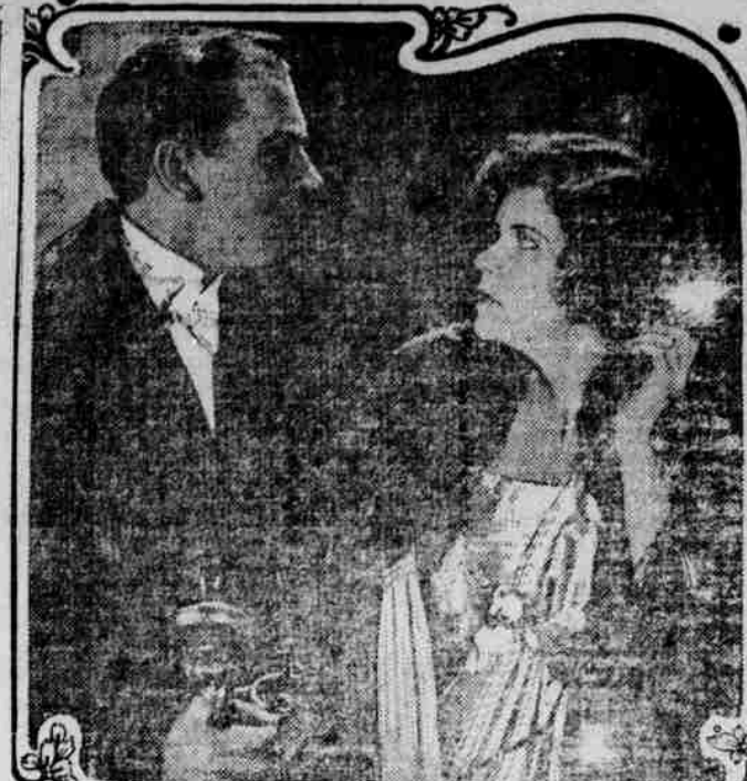
Matt Moore and Marjorie Daw in "DON'T EVER MARRY"