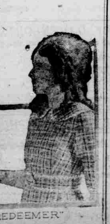
"THE GREAT REDEEMER"