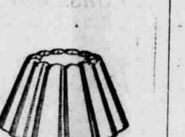
Individual Dessert Molds—Style—A. The same in pint size—Style—C