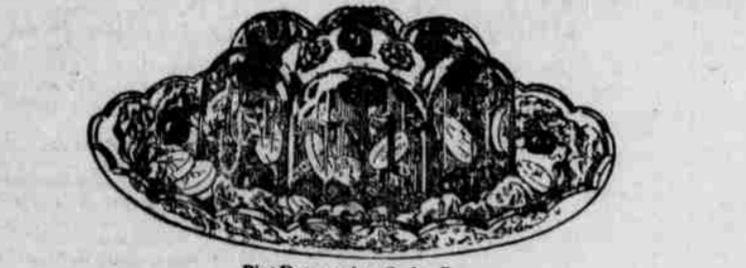
Pint Dessert size—Style—E