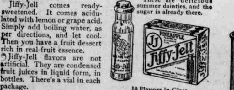
10 Flavors in Glass A Bottle in each Package: Mint, Raspberry, Orange, Elderberry, Lemon, Cherry, Strawberry, Pineapple, Coffee.

Sugar is scarce and high, yet now is the time for rich, juicy desserts. The solution is Jiffy-Jell. Serve it alone with its real-fruit flavors, or mix in fresh fruit if you wish.