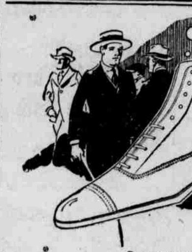
BUCKHECHT Fine Shoes are priced $8.50 to $14

Elks of Albany expect to attend the third annual state convention of Elks here July 22-23-24, 300 strong, it was learned today.