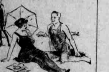
At the seaside too, the plump well rounded figure is most admired.

Nothing Like Plain Bitro-Phosphate to Put on Firm, Healthy Flesh and to Increase Strength and Nerve Force. The average person is beginning to realize more and more that the lack of physical strength and nerve exhaustion (frequently evidenced by excessive thinness) are the direct cause not only of the failure to succeed in life's struggle for the necessities of existence, but also for the handicap in one's social aspirations. Compare the thin, sickly, angular frame with the well rounded form