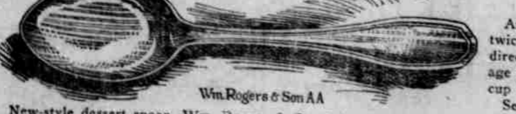
Teaspoon Size Wm. Rogers & Son AA

New-style dessert spoon, Wm. Rogers & Son AA silverplate, guaranteed 20 years. Contains no advertising. Send two trade-marks and 10 cents for first spoon, then we will offer you balance of the set.