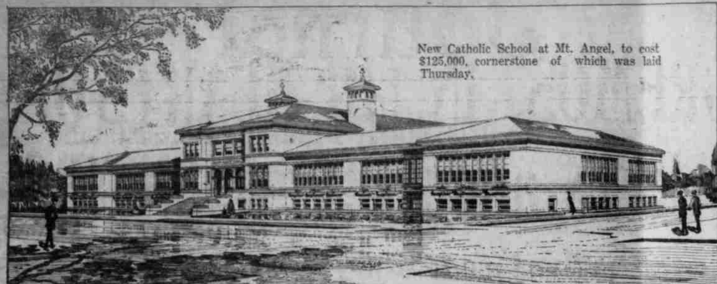
New Catholic School at Mt. Angel, to cost $125,000, cornerstone of which was laid Thursday.