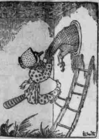
Chippy, Jr., at once let out a frightened cry.

HELP! HELP! And Rusty himself tumbled into the house and fell on top of him. As soon as they had picked themselves up, Rusty Wren and his wife