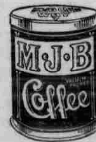
Remember We Stand Behind It.

There is no better coffee than M.J.B. Coffee regardless of price—WHY?