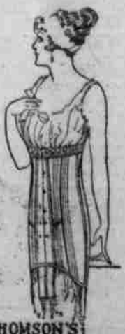
THOMSON'S "GLOVE-FITTING" CORSETS.

Full line colored thread. Buy all you want. No limit. Spool ..... 5c Dozen ..... 54c