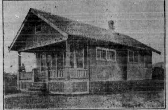
Large living room, dining room, kitchen, two bedrooms, with closets and hall, price $1809.00, f. o. b. Portland.

If you own your lot, I will loan you money to assist you in your enterprise. Over a dozen different plans to select from, $1,200 to $3,500