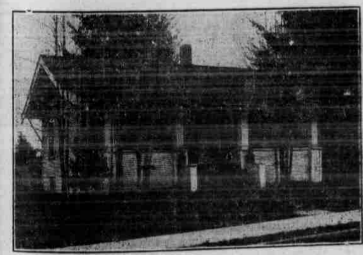
Large living room, two nice bedrooms with commodious closets, kitchen, bathroom. All materials as enumerated below. Price $1,286, f. o. b., Portland.

BUILD NOW! AUTHORITIES UNITE IN DECLARING THAT PRICES OF LABOR AND MATERIALS ARE IN NO DANGER OF BEING REDUCED Don't wait for building schemes to mature. Build your house yourself Use your spare time Complete plans furnished free, makes it easy for you ALL YOU NEED IS A HAMMER—THE STEEL BRIDGE OVER THE WILLAMETTE AT SALEM WAS MADE TO MEASURE—WHY NOT YOUR HOUSE READY-CUT GARAGES A NEAT AND COMPACT BUNGALOW