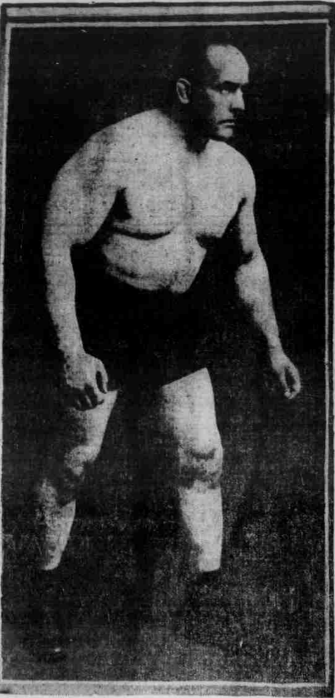
Stanislas Zbyszko, the famous Polish wrestler who has just set foot upon American soil after being interested in Russia since the world war. The world famous grappler is after Joe Stecher's scalp; for the championship and is confident that if he meets Stecher the glory will all be his.