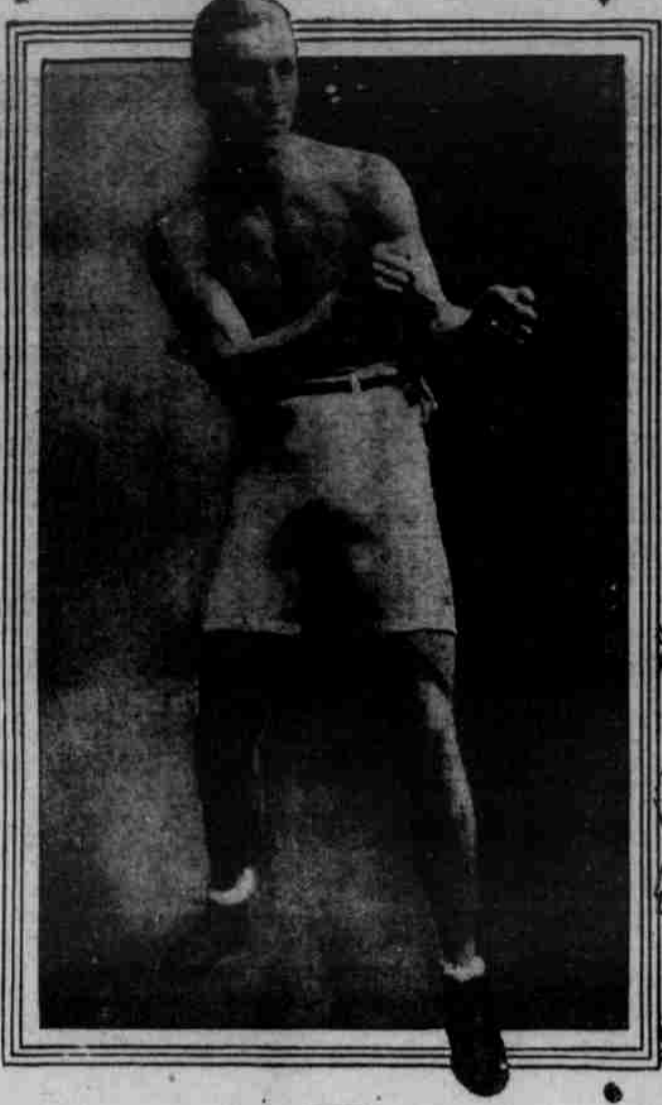
Here is the latest picture of Georges Carpentier, the famous French boxer, who will be Jack Dempsey's next opponent.