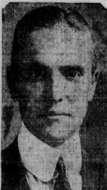
Robert F. Lansing (to left), who has resigned his office as Secretary of State, Frank L. Polk (on right) will become Acting Secretary of State until Mr. Lansing's successor is named and confirmed by the Senate.