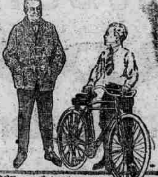
The Gift of His Dream