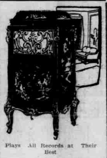
Plays All Records at Their Best