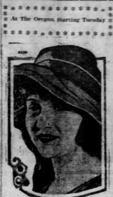
Betty Compson in "THE MIRACLE MAN"

D. A. WHITE & SONS Phone 160, 255 State St. Salem, Ore.