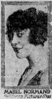
MABEL NORMAND Reveries Pictures

From ROSE MEL- VILLE'S Stage Success OTHER FEATURES TOO