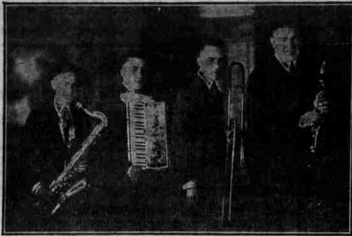
HARMONY 4 WITH McELROY'S JAZZ BAND

These 4 entertainers de lux are only one feature of many with McElroy. Not only do they play wonderful dance music but each one is an individual entertainer.