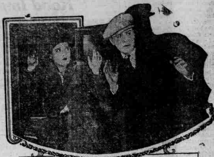
Mary Pickford in "The Hoodlum"