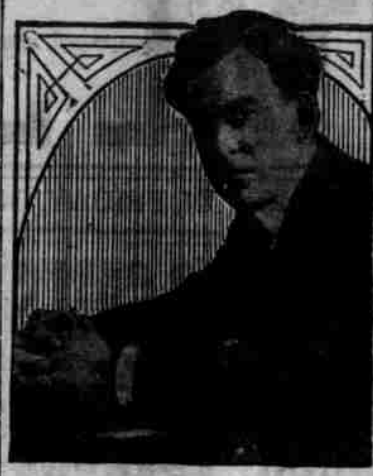
WILLIAM DUNCAN IN VITAGRAPH BIG SERIAL "SMASHING BARRIERS" BLIGH THEATRE