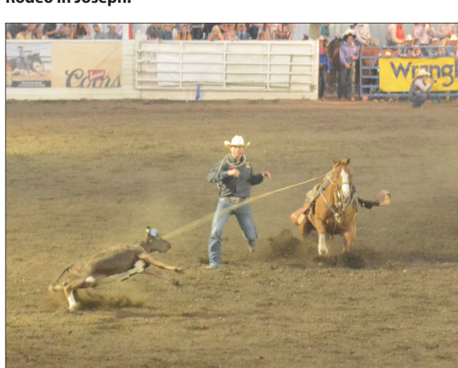
A tie-down roper dismounts and runs for the steer Saturday, July 30, 2022, during the final night of the 76th Chief Joseph