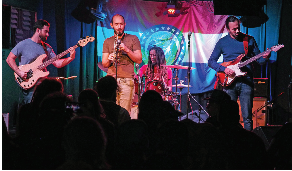
Marbin, a jazz fusion band from Chicago, plays July 12 at Churchill School in Baker City.