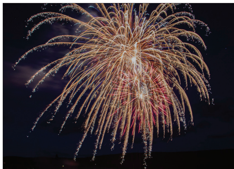
Fireworks launch into the sky Monday night July 4, 2022, and fall into Wallowa Lake for the Shake the Lake celebration on Independence Day.