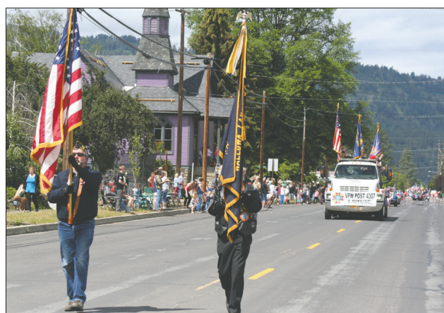
The national colors and those from the Veterans of Foreign Wars Post 4307 in Enterprise lead the annual Fourth of July Parade in Wallowa on Monday, July 4, 2022.

of Three Bears Towing in Wallowa, said that recognizing veterans is what the Independence Day means to him.