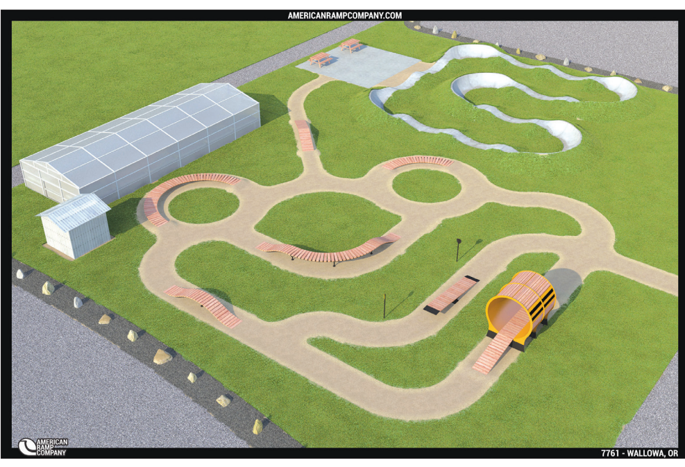
Ground was officially broken Monday, June 27, 2022, for the new bicycle playground to be constructed behind Wallowa Schools.