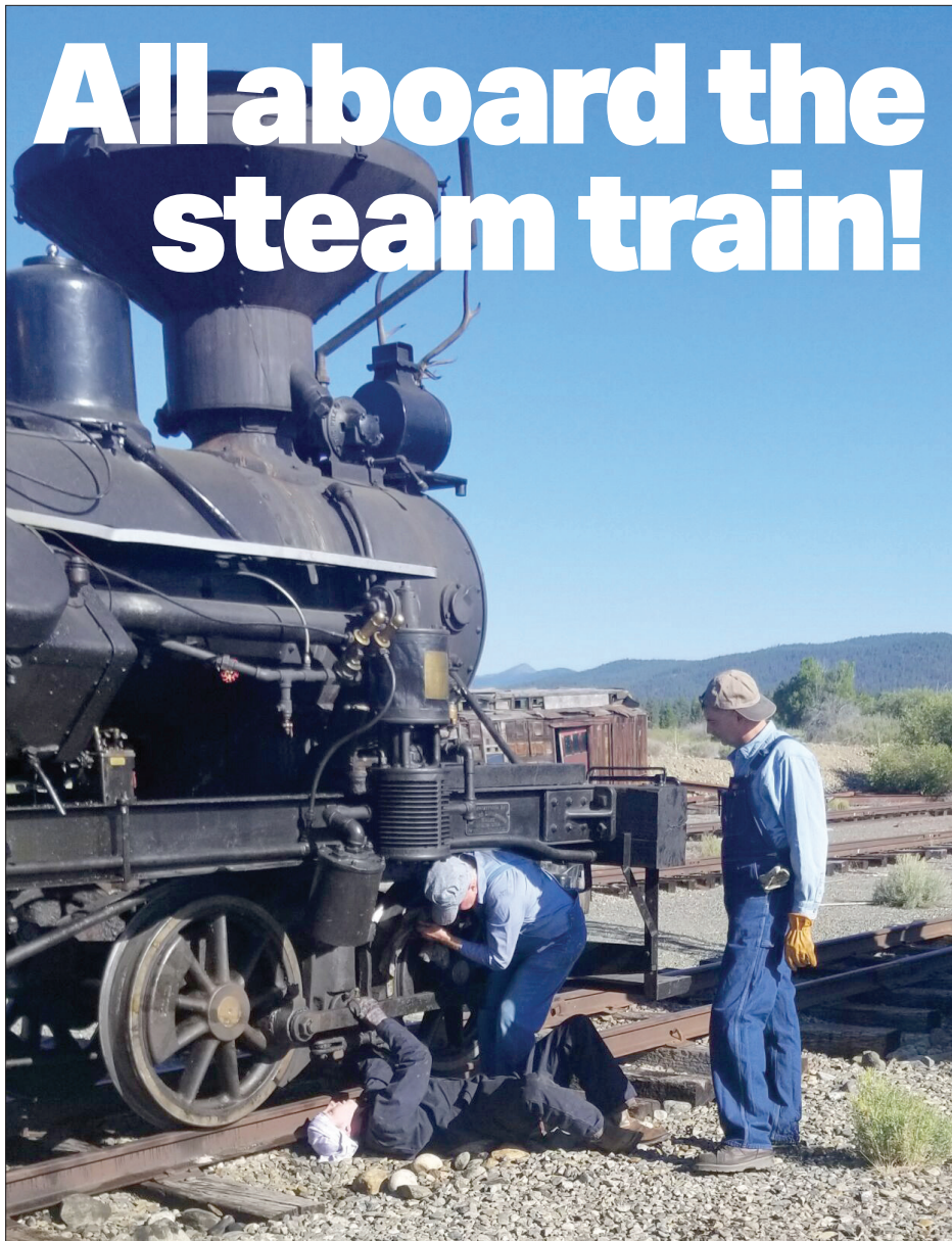
Crews have been busy getting ready for the Sumpter Valley Railroad's 2022 season.