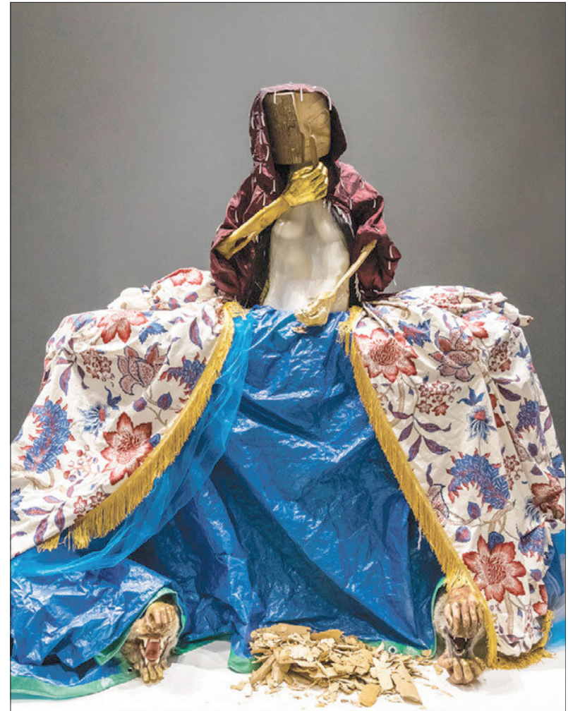
This creation by Merritt Galanin is featured in "You Are Here," an exhibit at Tamástslíkt Cultural Institute.

Tamástslíkt is located at 47106 Wildhorse Blvd. at the