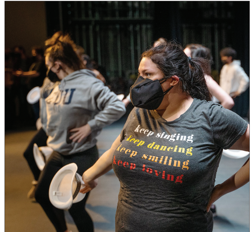
EOU students rehearse "We've Got Your Number" on Jan. 26, 2022. Performances are set for Feb. 25 and 26 at McKenzie Theatre.

The decision was made to postpone the production to