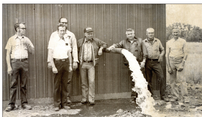
Wallowa City Council members visit the old Bates Mill site in 1984.

shortage of transformers and line materials has delayed electric line construction, Pacific Power & Light has completed service for 104 new electric users in the Enterprise district during the past 12 months.