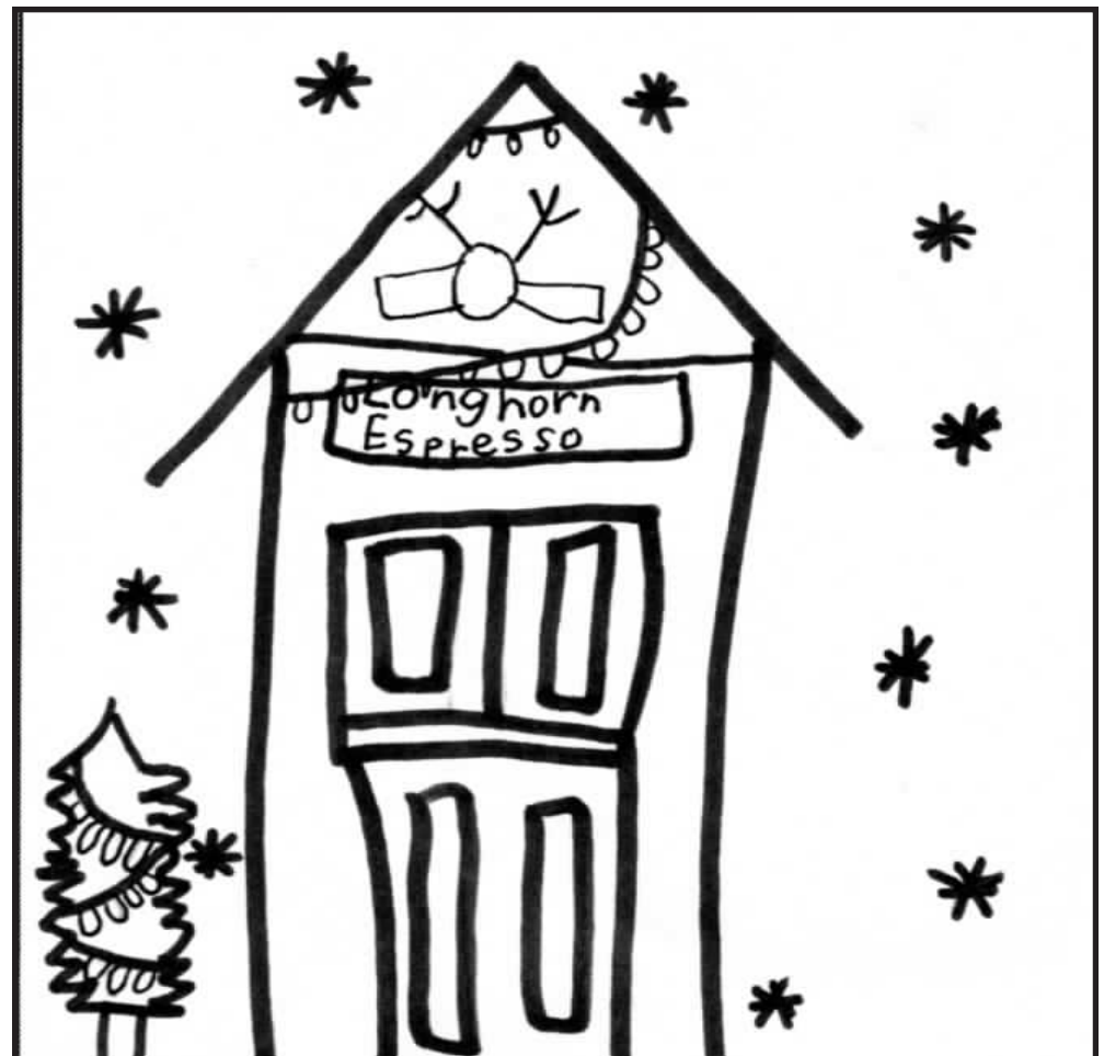
Quinn Stangel 2nd Grade - Enterprise