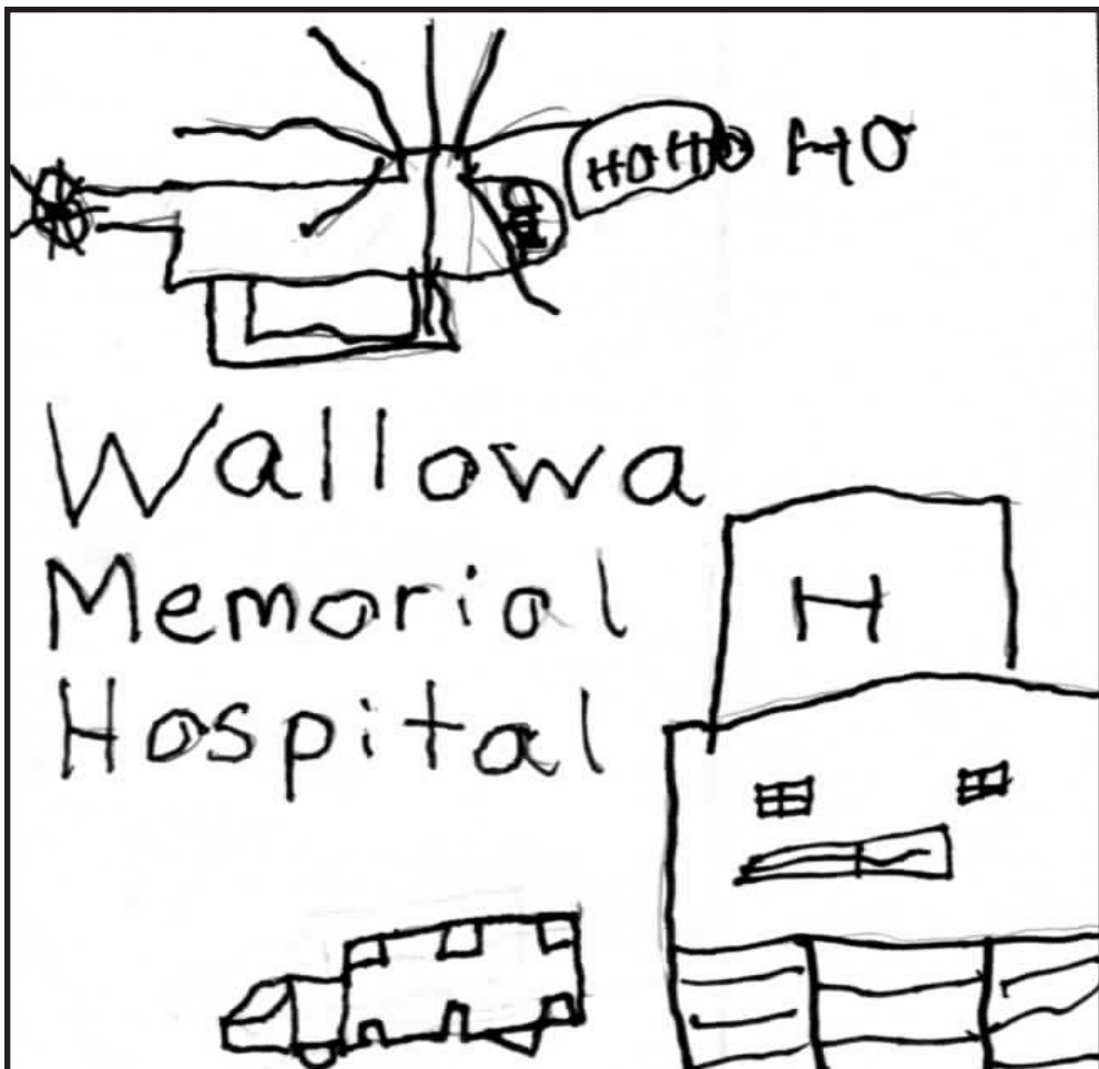
Marshall Taggart 3rd grade - Enterprise