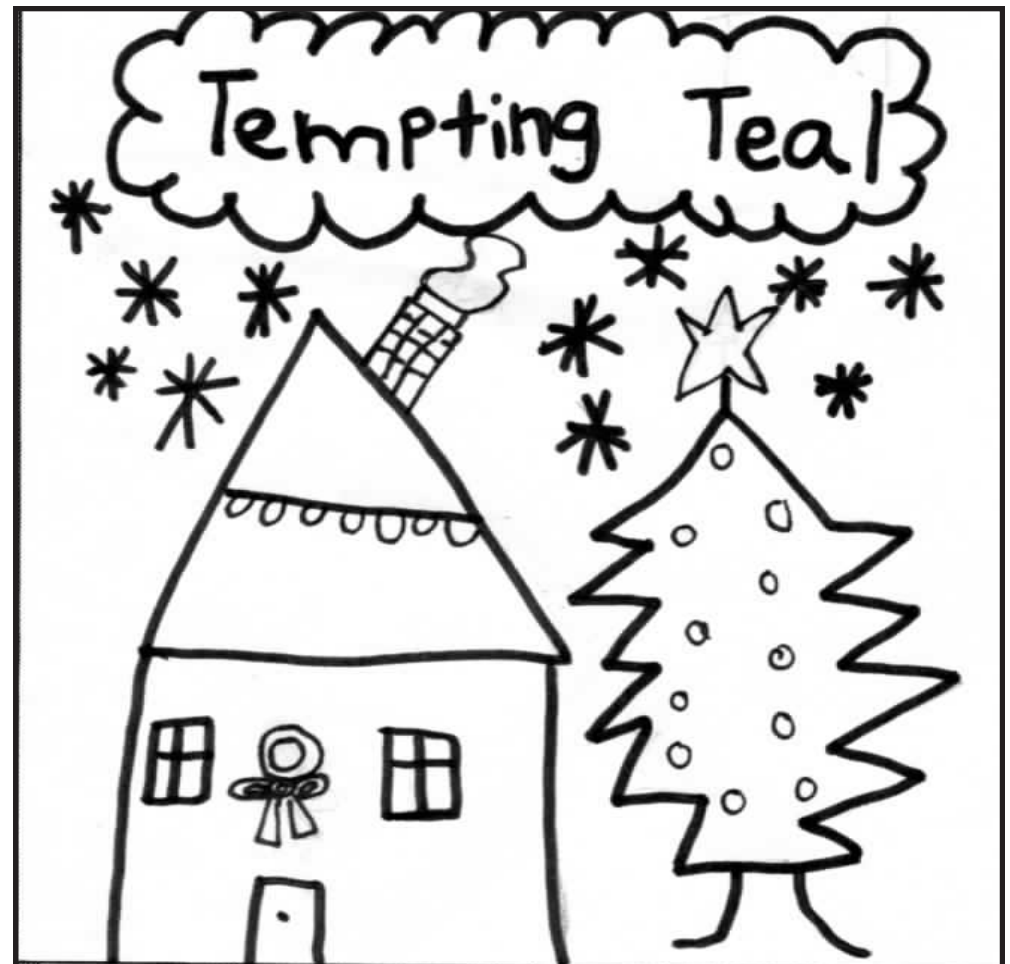
Emmy Rahn 2nd Grade - Enterprise