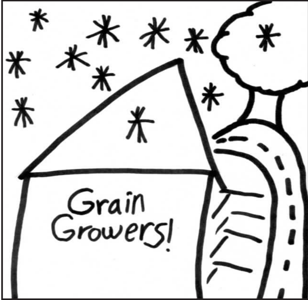
Rhilynn Compton 2nd Grade - Enterprise