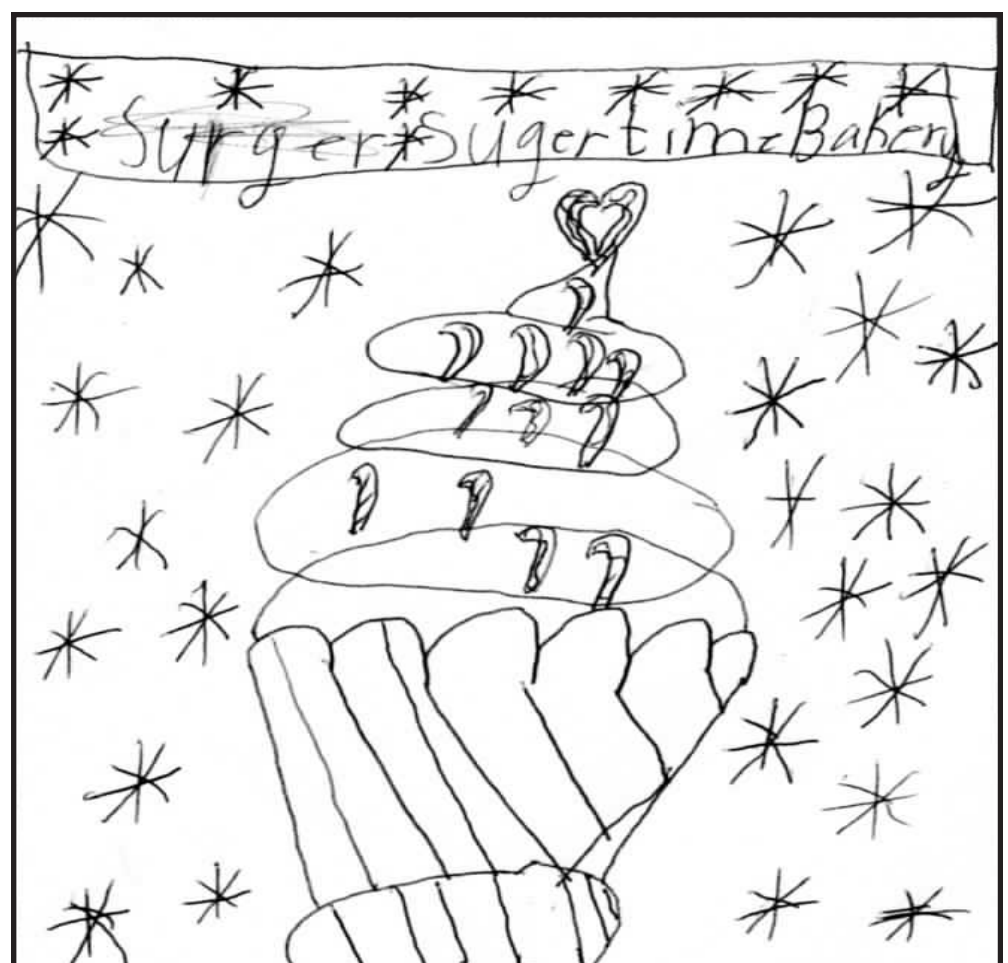
Kadee Sneed 3rd Grade - Enterprise