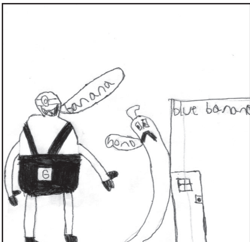
Caleb Eckel 3rd Grade - Wallowa