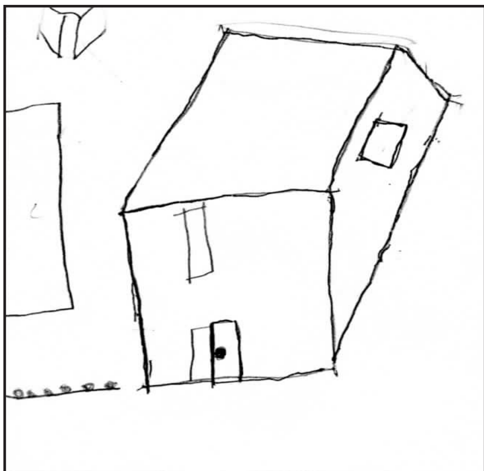
Brodie Waters 2nd Grade - Wallowa