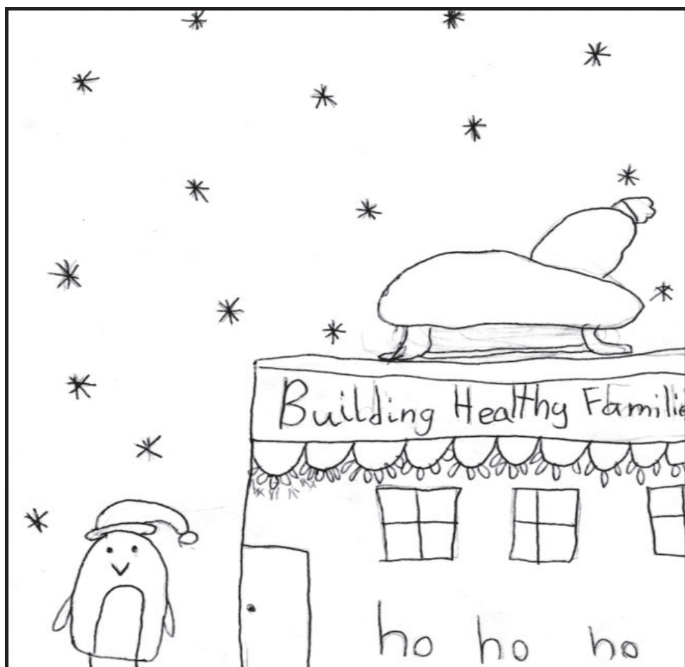
Emery Duquette 3rd Grade - Enterprise