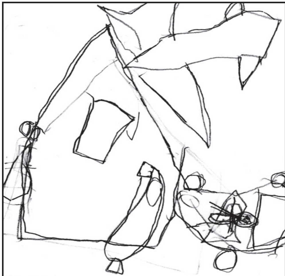
Tessaray Schoeszler 2nd Grade - Wallowa