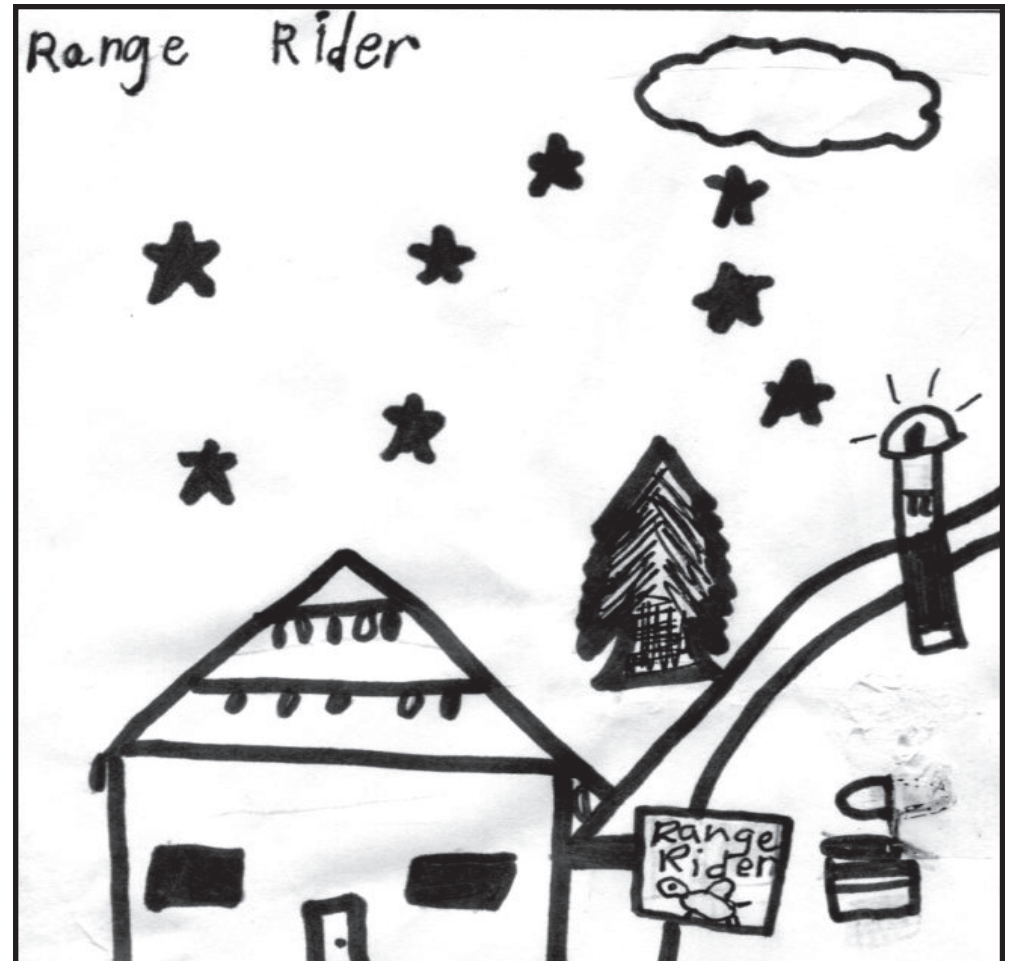
Amelia Park 2nd Grade - Enterprise