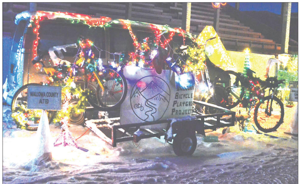
Wallowa County Alternative Education made sure their presence was known at the Fair Lights display Friday, Dec. 17, 2021, at the Wallowa County Fairgrounds. The group is promoting a proposed bicycle playground in Wallowa.