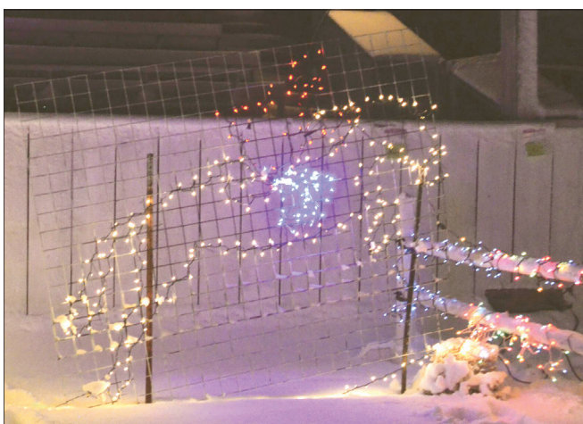
A rider on a leaping horse is the display set up by the Nez Perce Riders at the Fair Lights that started Friday, Dec. 17, 2021, at the Wallowa County Fairgrounds.