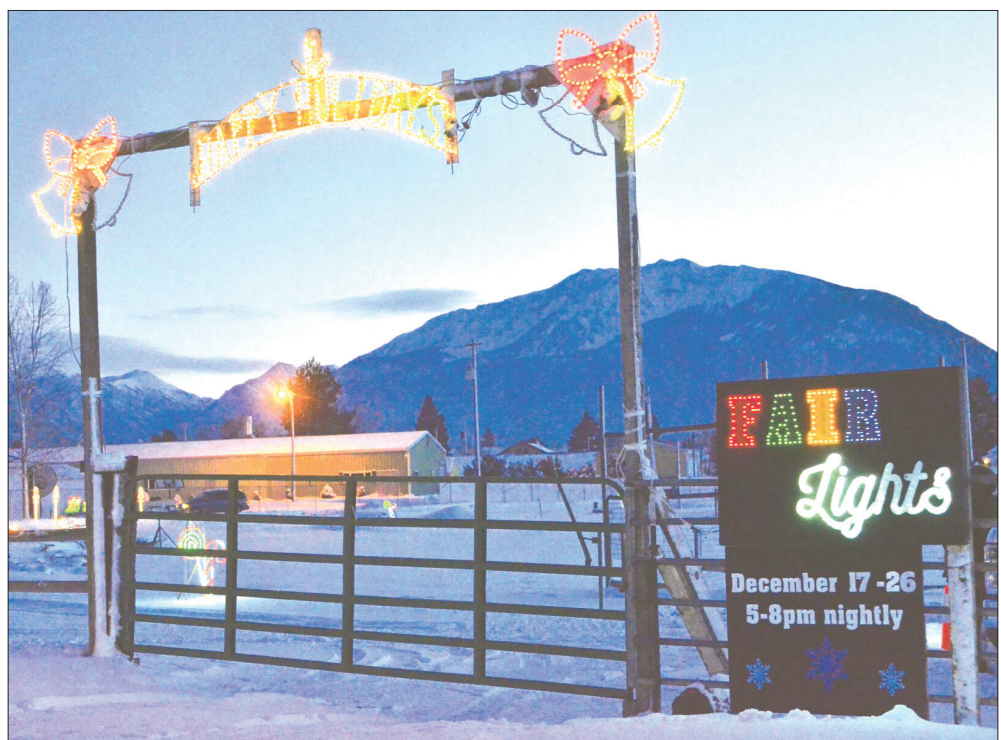
The gate to the Fair Lights display Friday, Dec. 17, 2021, at the Wallowa County Fairgrounds wishes visitors happy holidays. Fair Lights runs through Dec. 26.