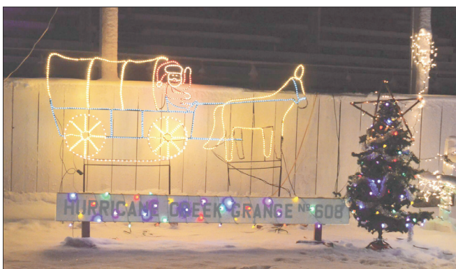
The Hurricane Creek Grange's display at the Fair Lights on Friday, Dec. 17, 2021, at the Wallowa County Fairgrounds put Santa in a covered wagon reminiscent of the early settlers of the county.