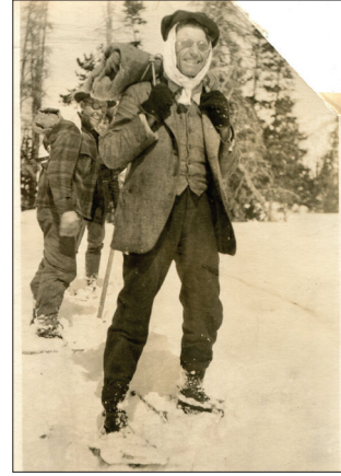
A group heads out snowshoeing in this undated photo.

band teacher at Enterprise High school, was sentenced to three years in the penitentiary on a charge of larceny. He was charged with stealing musical instruments from the school. He was released on parole on condition that he pay the owners of the musical instruments, amounting to $285, and pay the county all costs incurred in prosecuting the case, amounting to $500.