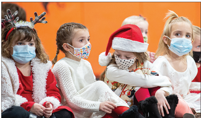
Kindergartners await their next call to perform at the Wallowa School's K-fourth grade Elementary Christmas concert Wednesday, Dec. 8, 2021.