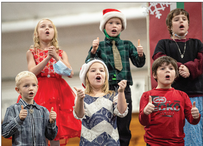
Second-graders singing "What do I want in my Christmas Stocking?" at the Wallowa School's K-fourth grade Elementary Christmas concert Wednesday, Dec. 8, 2021.