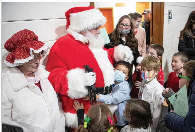
Wallowa concert-goers and participants crowd around Santa to share their Christmas wishes after the Wallowa School's K-fourth grade Elementary Christmas concert Wednesday, Dec. 8, 2021.