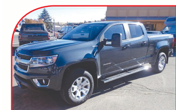
2018 CHEVROLET COLORADO LT

Stock # 11054 4WD, A/C, ABS, CD, PB, PS, PW, Pwr Locks, Pwr Mirrors $36,950