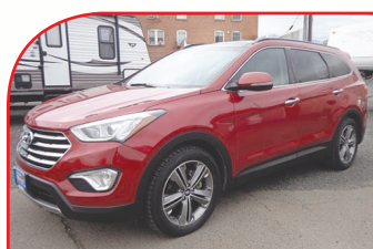
2014 HYUNDAI SANTA FE GLS

Stock # 11059 RWD, VERY NICE! $ Call 4 Price