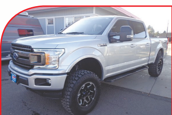
2018 FORD F150 SUPERCREW

Stock # 11054 4WD, A/C, ABS, CD, PB, PS, PW, Pwr Locks, Pwr Mirrors $36,950