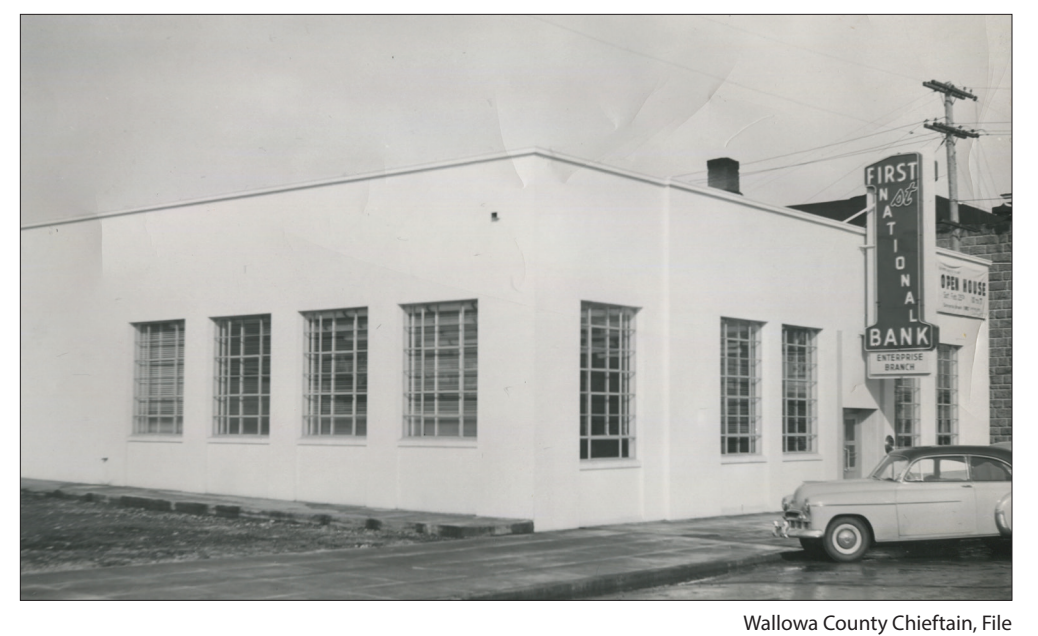
First National Bank of Enterprise, as it looked in the 1950s.

This evening the pictures of the Oregon Social Hygiene society will be shown free at the O. K. the-