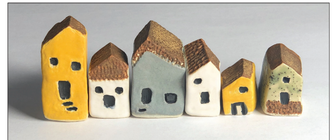
These small ceramic houses are examples of the “Little Works” that will be entered in a new exhibit at the Joseph Center for Arts and Culture beginning Monday, Oct. 11, 2021.