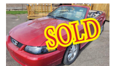
2003 MUSTANG- V6, Convertible, Only 32k Miles!