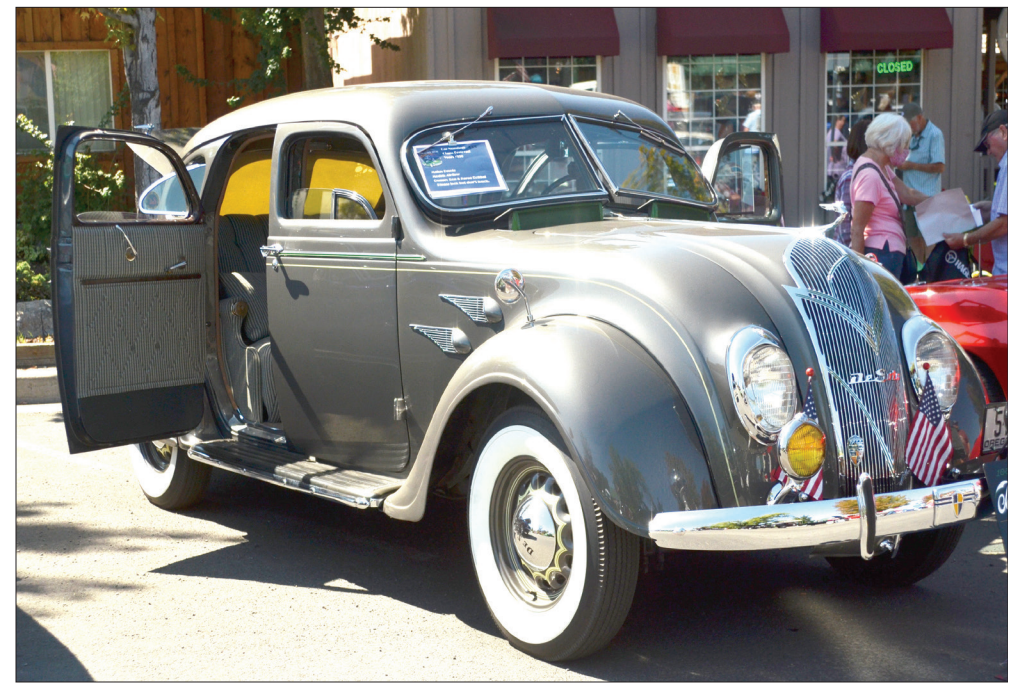
This 1936 Desoto Airflow, complete with rear "suicide doors," was judged King of the Mountain on Saturday, Aug. 28, 2021, during the Wallowa Mountain Cruise in Joseph.