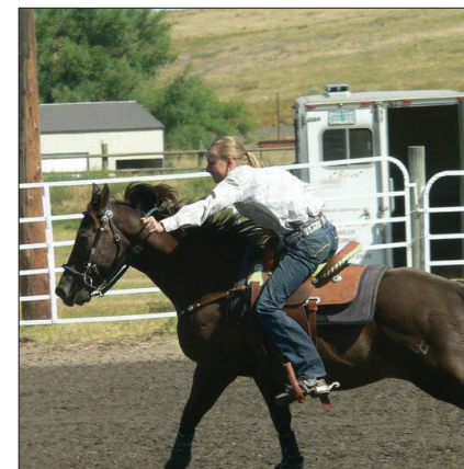
The Wallowa County Fair runs Aug. 6-14 in Enterprise.

Food, craft, jewelry, antiques, education and food vendors are welcome Aug. 6 and 7 and Aug. 11 and 14. Call 541-426-4097 to sign up.