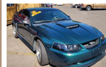
2001 MUSTANG- V8, Leather, Stick Shift, Stage 1 Build!