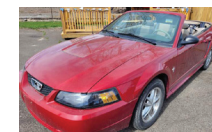
2003 MUSTANG- V6, Convertible, Only 32k Miles!