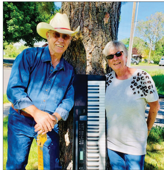
Barefoot & Bonafide plays Saturday, July 31, in Baker City.

Hermiston-based Brass Fire plays jazz, funk, blues, rock and swing in the Eastern Oregon