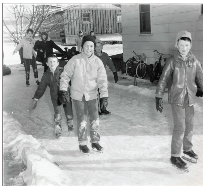
Wallowa County Chieftain, File

A wage scale has been adopted by the Wallowa county farm bureau. It is considerably lower than last year but the products of the farms and ranches have decreased in value so much that it is impossible for farm owners to employ any help. The scale is as follows: Common farm laborer, $40/month and board; Cooks, $30/month