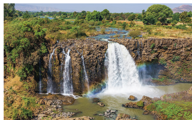
A.Savin The Blue Nile Falls fed by Lake Tana near the city of Bahir Dar, Ethiopia.

VFW TACO NIGHT: 5 p.m. to 8 p.m. VFW Hall, Enterprise. $8. KICKBOXING FITNESS CLASS: 6:15 p.m. Oddfellows Hall in Enterprise. Hurricane Point Fitness. No experience necessary. Certified instructors. 541-398-2131.