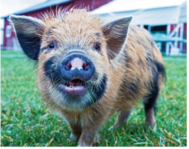
Ellen Morris Bishop

If you go, you'll be among the select 100 folks whose tickets ($25 for adults, $12.50 for those 16 and under) support local food producers and help small local farmers and