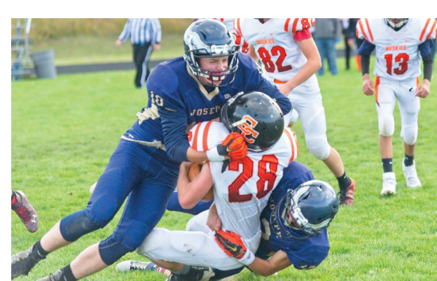
Munch and Crunch — A Sherman/Condon runner finds himself in a familiar place — sandwiched between Eagles' defensemen during Joseph's Saturday, Oct. 5, 61-6 win.

"We out-gained them, offensively," he said. "We just ran out of gas. We basically had eight guys who never left the field.