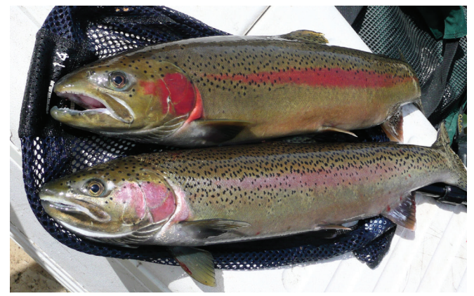
Idaho Fish and Game

side. To sign up: Email Chad Dotson at chad.dotson@tnc.org or sign up at the TNC Enterprise office 906 S River st. Deadline to apply October 25.