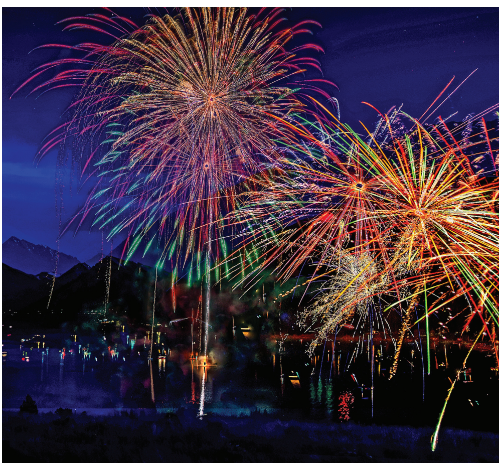
Ellen Morris Bishop

Shake the Lake has put on a great fireworks display, but needs more than $6000 in contributions to continue next year.