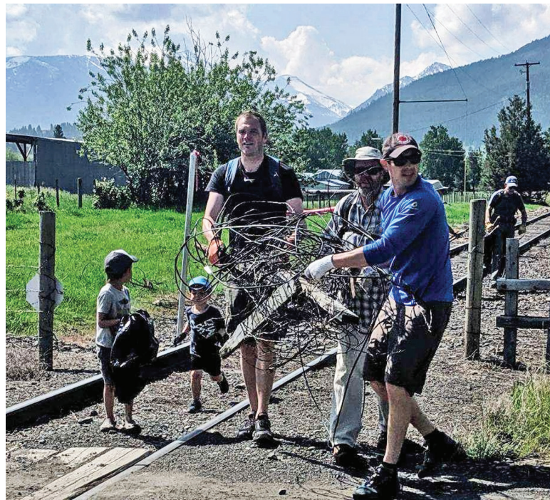
Rails with Trails volunteers remove a large wad of wood and wire from the railroad right of way during their walk along the rails Saturday, June 1.