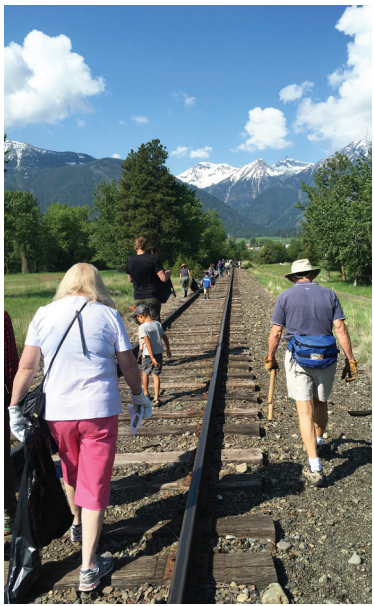
JBTC volunteers hike toward Joseph along the WURR railroad tracks on June 1. They were cleaning debris and weeds from the WURR right-of-way.